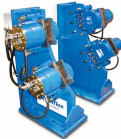
VKSD-FL brake stations utilized on two geared ball mills.