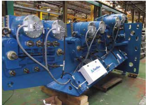
One of two VMS-DP brake stations supplied for the 12.2 m diameter gearless SAG mill.

Powell concluded by saying “Twiflex focus is on developing and introducing new products to the mining industry and the company have recently launched new spring applied, hydraulically released brakes (VBS, VCSD and VKSD large pad) for this market. We are currently working on low temperature versions of these brakes in addition to on-going product development and improvements. Our intention is to develop a larger VMS-DP for gearless mills.”